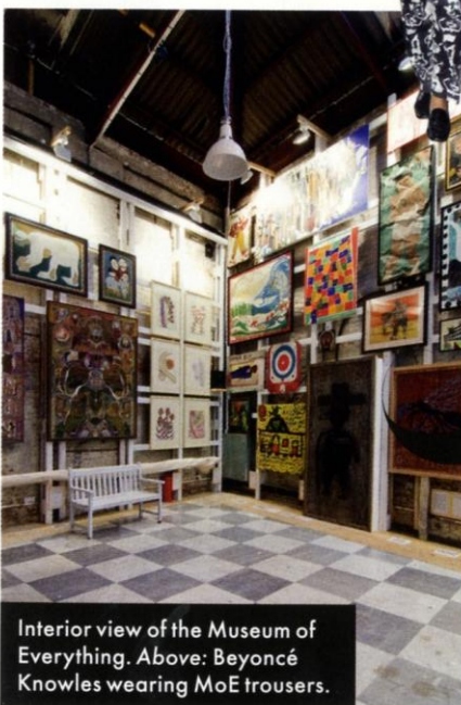
Interior view of the Museum of Everything. Above: Beyoncé Knowles wearing MoE trousers.